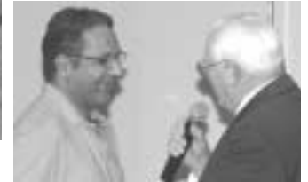
50TH ANNIVERSARY ANNUAL MEETING